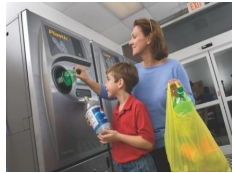
A reverse vending machine

The program would be operated by a nonprofit Beverage Container Stewardship Organization selected by the Maryland Department of the Environment (MDE), representing all producers that sell beverages in the state. MDE would provide substantial oversight, approving stewardship plans and annual reports, and setting the programs' convenience standards and handling fees for redemption points. An Advisory Council of stakeholders would advise MDE on plan approval, implementation, and performance.